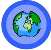
Place and Space